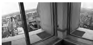
A view of the city from the Pyramid Club