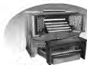
RODGERS DIGITAL ORGANS PIPE-COMBINATION ORGANS

New 4 Manual Console to be interfaced with 45 Rank Casavant Pipe Organ at Sligo Seventh Day Adventist Church Takoma Park, Maryland