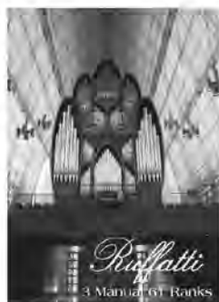
Fratelli Ruffatti Pipe Organs Padua, Italy

New 4 Manual Console to be interfaced with 45 Rank Casavant Pipe Organ at Sligo Seventh Day Adventist Church Takoma Park, Maryland