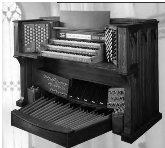
American Classic V 80 Voices, 5 Divisions, Floating Solo

European quality and design now in America